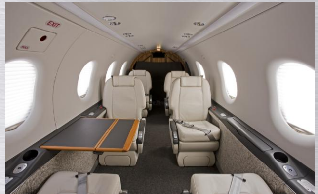
Interior photos to be updated upon interior completion