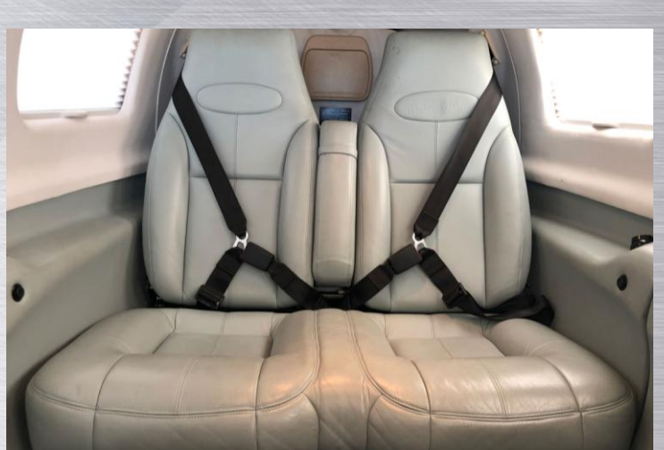
Offered at: $899,500 Verification of specification is the sole responsibility of Purchaser. Aircraft subject to prior sale and/or removal from market. Current as of 04/05/19.