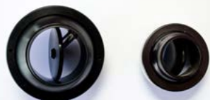
MaXus Air OEM

Providing more than 4 times the air flow and efficiency of the original system for comfort while on the ramp, during taxi or in flight. BTUs increase from stock of 3,500 to 18,000.